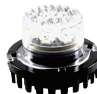
LHE R65 R10