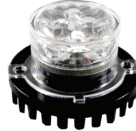
LHD R65 R10