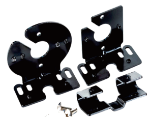
C Bracket L Bracket